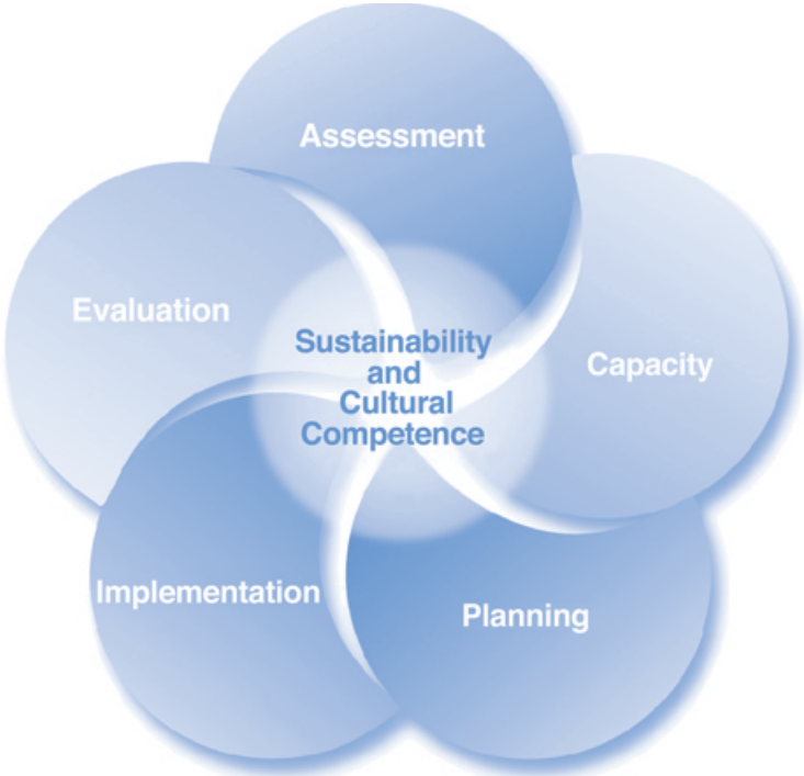
Figure 1. The Strategic Prevention Framework

A word about words What is your goal? Your aim? Your objective? Perhaps more importantly, what is the difference? At times, the terms seem interchangeable. Often, the difference depends on who is funding your efforts. To minimize confusion, we have added a chart (see page 38) that highlights terms often used to describe the same or similar concepts.